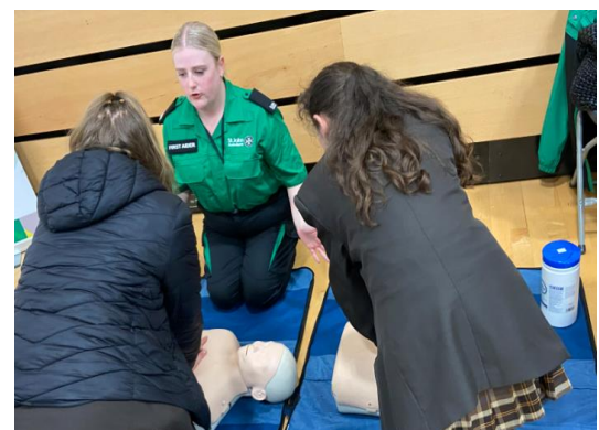
28 th October 2024