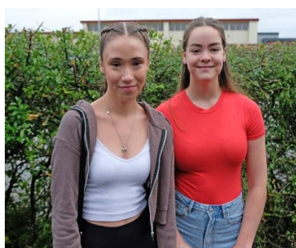
11 th September 2023