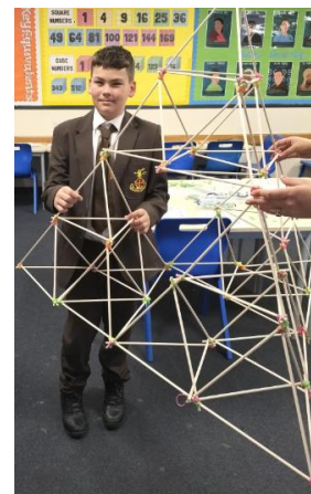
27th September 2021